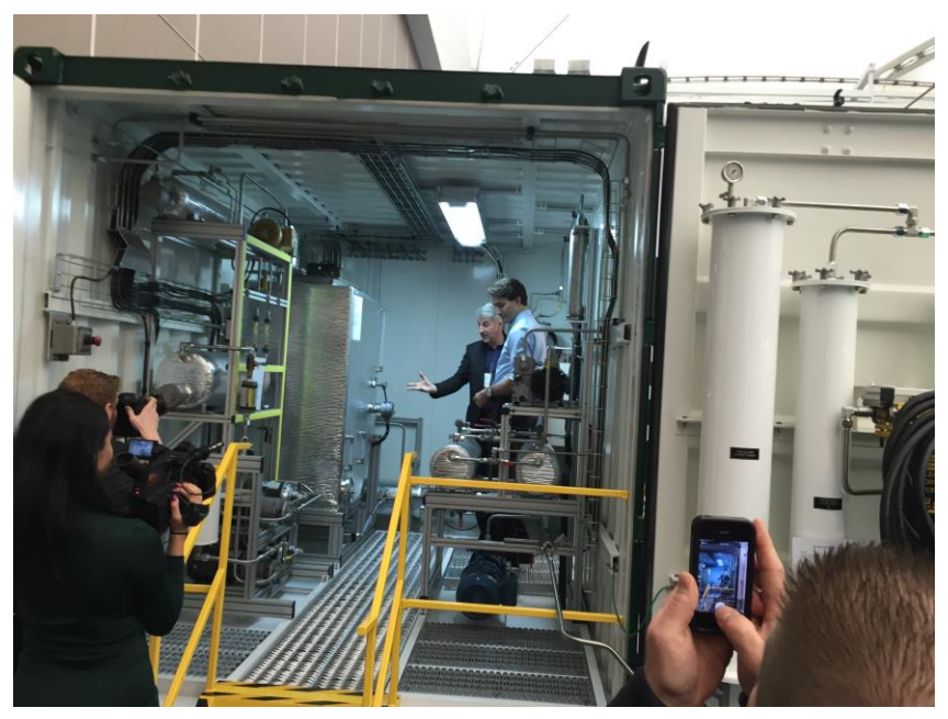
The Right Honourable Justin Trudeau, Prime Minister of Canada is shown

the \mathsf{BioCube}^{\scriptscriptstyle\mathsf{TM}} by Peter Wilken, Director BioCube Corporation