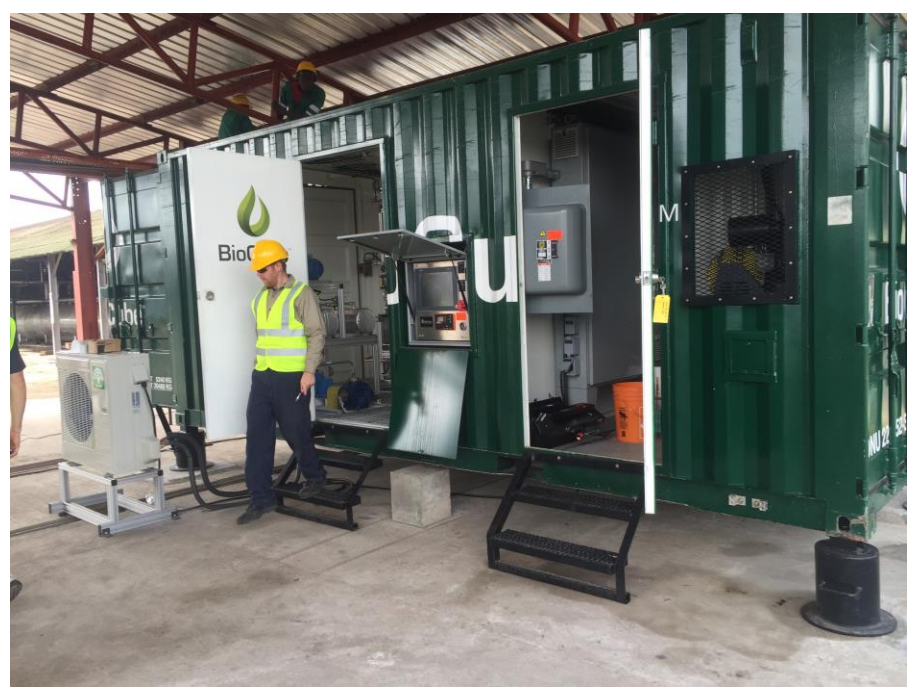
The BioCube™ in operation at a Palm Oil Mill, Africa 2016