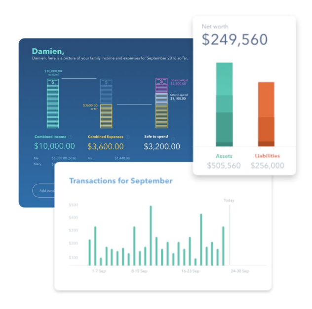
"PictureWealth provides you with a "Welfie" - basically a snapshot of your personal finances"

As a career long financial adviser and award-winning entrepreneur, I often pondered how high-quality advice, usually limited to those with a lot of money could be made available to everyone, for free. I soon concluded that the digitisation of financial advice was inevitable, so why not be at the forefront of that journey and help build it? For me, the future of advice empowers people to have full visibility across their money. Our technology can advise people on what to do and hence remove the financial uncertainty that exists in day-to-day life.