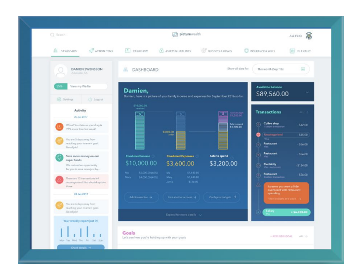
"PictureWealth can integrate many partners via the nature of the online setting."

working together and adding value to their clients. The financial industry automatically lends itself to this concept and PictureWealth can integrate many partners via the nature of the online setting.