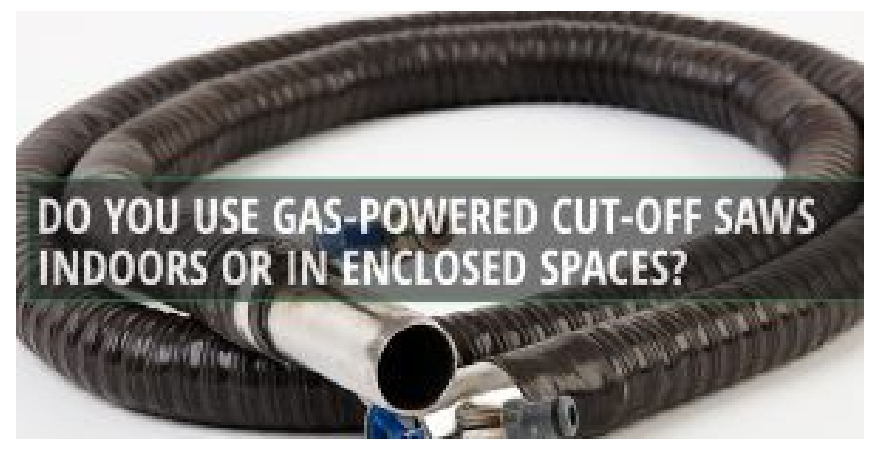
The Fume Tube attaches to petrol-powered saws and removes exhaust fumes including carbon monoxide via an attached vacuum system.

According to Dr Mark Rainbird, director of <u>Funding Strategies</u>, "Guarda's solution to the silica dust issue is proven, unique and cutting edge. It's an example of an innovative Australian success story now gaining significant acknowledgment internationally."