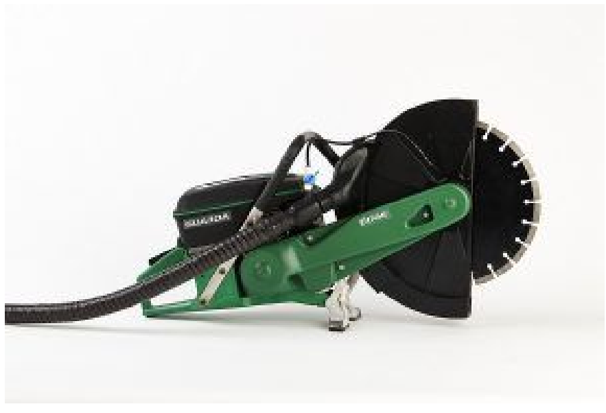
The Edge Saw captures and removes silica dust and exhaust fumes, including carbon monoxide, via an attached vacuum system.

Guarda Group Holdings is working alongside Funding Strategies, a specialist business advisory group assisting the company with expansion.